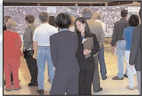
Public meetings such as this one provide an excellent opportunity to work with the community on cultural resources issues.

Depending upon the size, complexity, or controversial nature of a project, the public's interest may vary substantially, but it is incumbent upon the project sponsor to elicit input from the potentially affected parties. The first step is to prepare a mailing list that identifies the groups and individuals who should be made aware of projects, and to invite them to participate in the process. The public should be solicited to offer information on significant cultural resources in the area, regarding both historic structures and archaeological sites, so that project planners have as much information as possible when making critical project decisions. Participation during this stage could include meetings, mailings, website solicitations, and other tools.